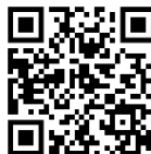
Junior / Youth Xpress