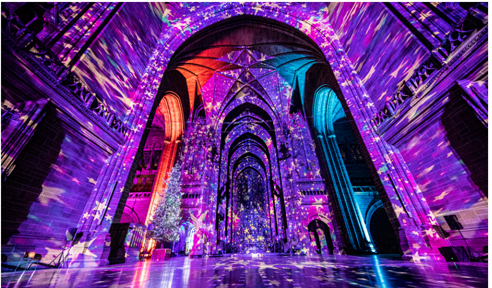
© Christmas Lightshow at Liverpool Cathedral, created by Luxmuralis.

The proceeds from The Angels are Coming! at Southwark Cathedral will go towards supporting the cathedral's mission and ministry, safeguarding its heritage and to developing its outreach and education offerings.