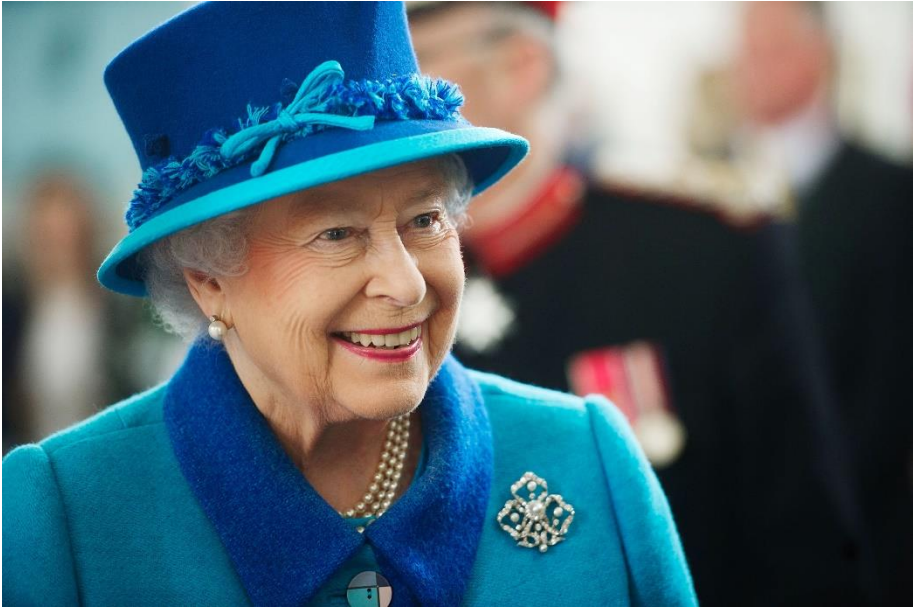
Her Late Majesty Queen Elizabeth II