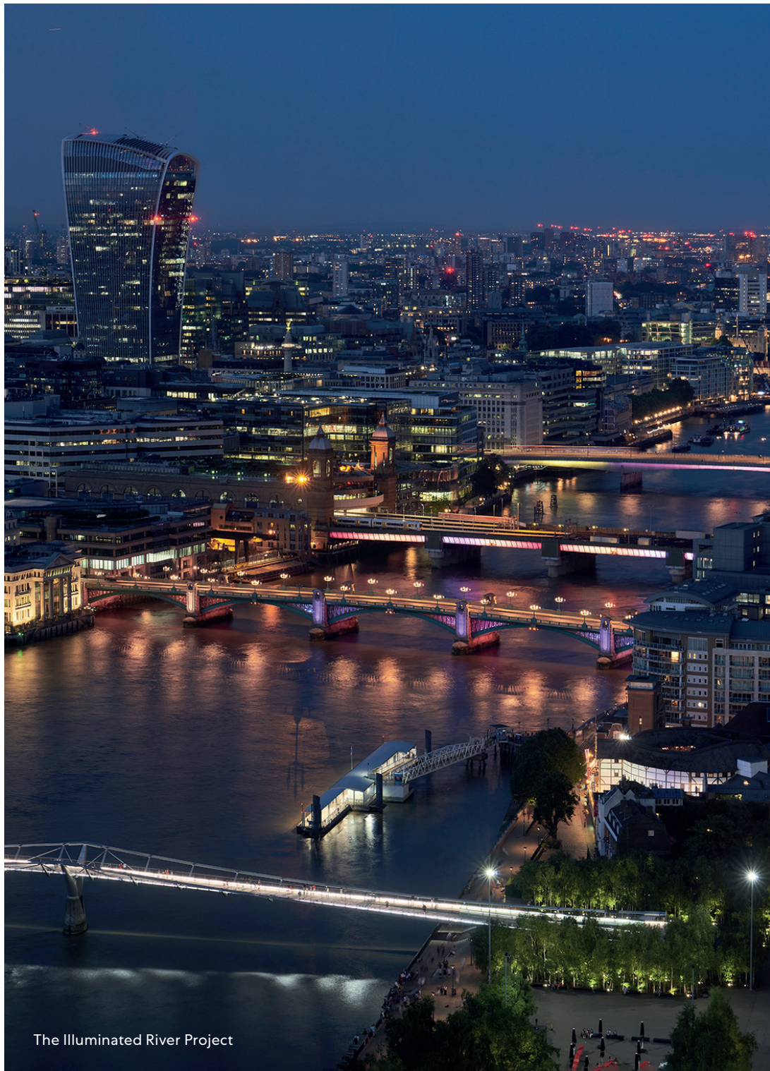
The Illuminated River Project