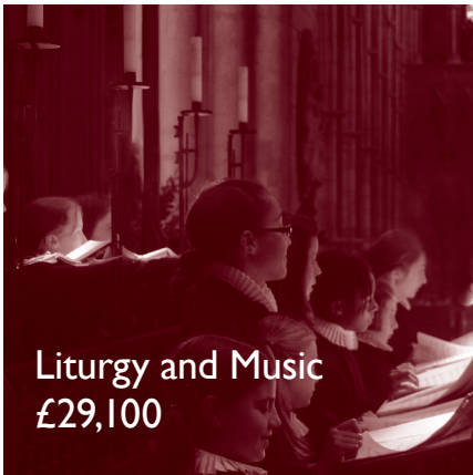
Liturgy and Music £29,100