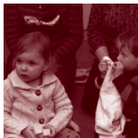
Congregation and Education £1,300