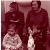
Community and Outreach £10,600

In 2018, each month we will spend £152,200: