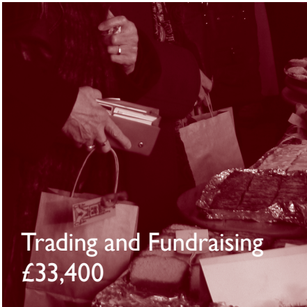
Trading and Fundraising £33,400