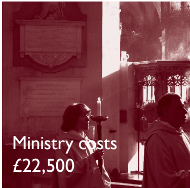
Ministry costs £22,500