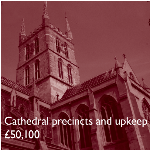
Cathedral precincts and upkeep £50,100